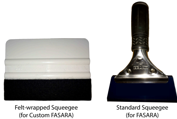
Figure 1. Felt-wrapped and rubber squeegees for FASARA installation