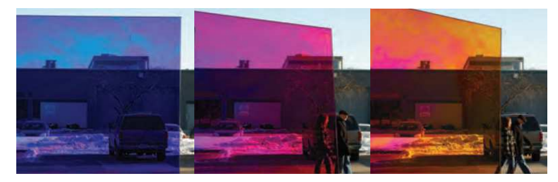
Chill Product: Blue/Magenta/Yellow in transmission at various angles